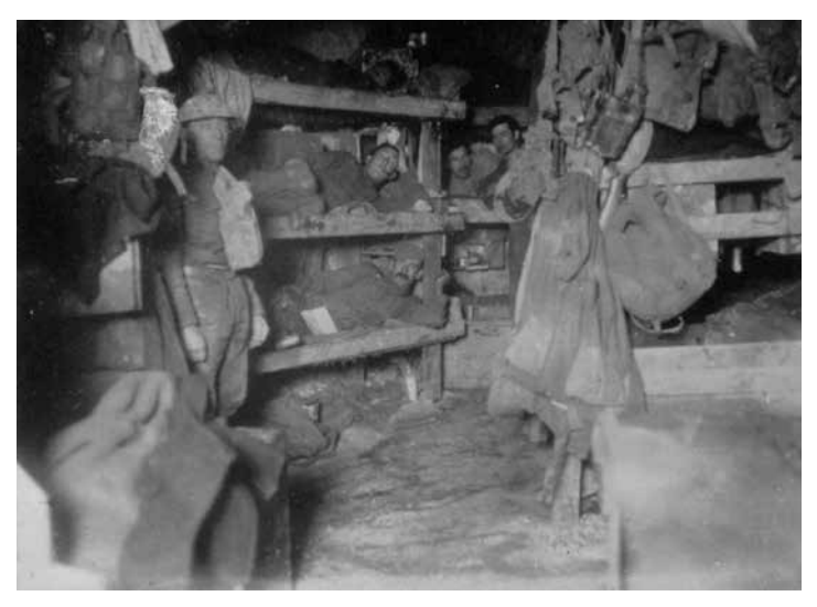
Tunnellers bunking down underground

The completed underground system could house 20,000 to 25,000 men. The tunnels had running water, electric lights, kitchens, latrines, a tram system and a fully-equipped hospital with operating theatres and mortuaries. So extensive was this system that in order to find their way around, they gave names to the galleries. The "main highway" was Godley (most senior New Zealand commander on the Somme) Avenue, connecting Russell, Auckland, New Plymouth, Wellington, Nelson, Blenheim, Christchurch, Dunedin and Bluff.