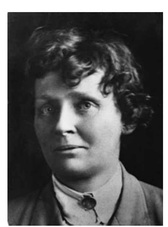
Ettie Rout's passport photograph in 1918

The story of Ettie Rout shows up much about the hypocritical attitudes of her day. Although her work was of