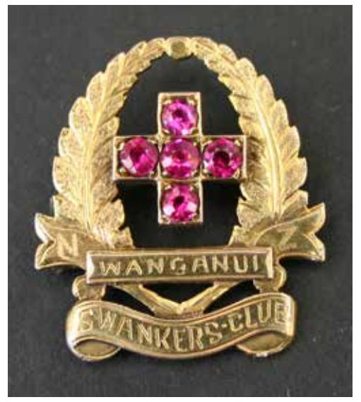
Swankers' Club badge Whanganui Regional Museum Collection ref: 2005.67

The Wanganui Swankers' Club was formed during World War I to raise funds for patriotic purposes, in particular to support the Red Cross and Red Cross Nurses; hence, the red cross is part of the Swankers' Club badge.