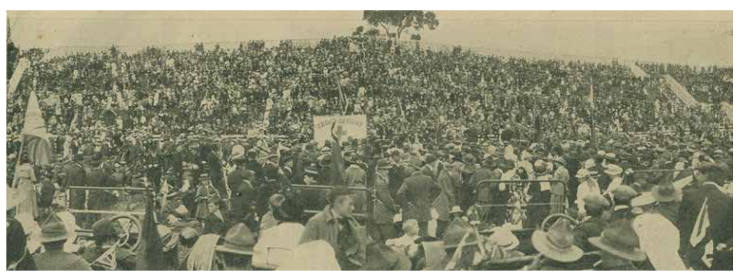
Whanganui citizens celebrate the end of the war on Armistice Day, 11 November 1918 Photographer: unknown Auckland Weekly News 21 Nov 1918

Other thanksgiving services were held in local churches and were well attended. "At night, rejoicing continued to a late hour with thousands gathering at various places,