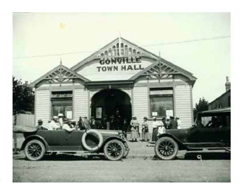
Gonville Town Hall, site of a temporary hospital during the 1918 influenza crisis

Wanganui Hospital was inundated with the sick and quickly became inadequate for the influx of very ill people. A temporary hospital was set up in the Stewart