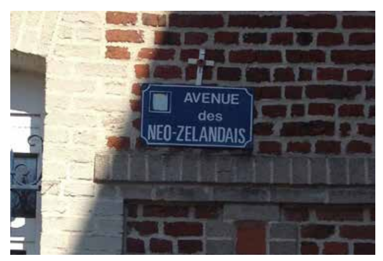
Avenue des Néo Zélandais