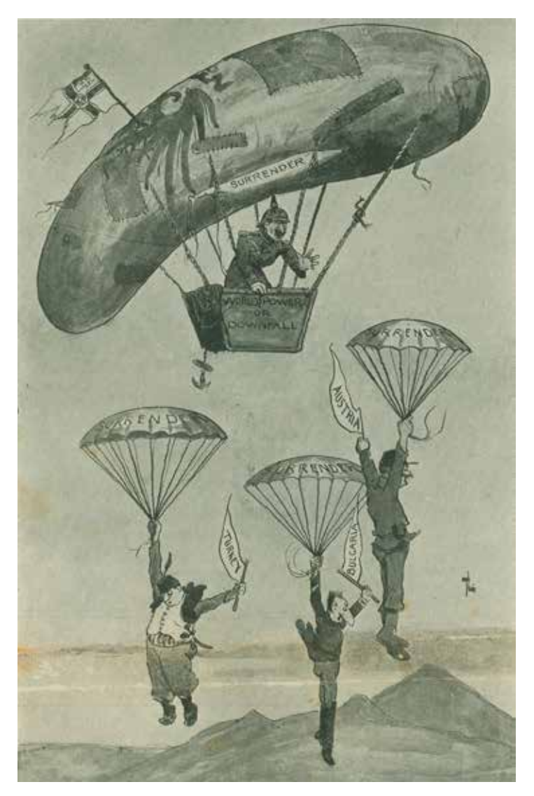
Armistice cartoon Artist: unknown Auckland Weekly News 14 Nov 1918

In October 1918 the German military command wrote to the Kaiser informing him that victory was not possible. Germany was also having problems at home. Food supplies in the country were running out. Sailors revolted at the naval port of Wilhemshaven. This unrest spread throughout the country, and on 9 November 1918, a German Republic was proclaimed, followed by the announcement of the abdication of the Kaiser.