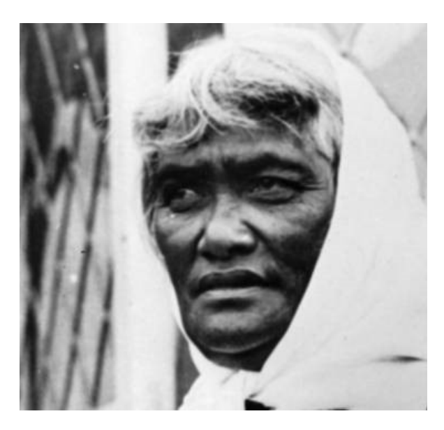
Princess Te Puea

Te Puea Herangi, known as Princess Te Puea, was the grand-daughter of the Māori King, Tāwhaio Te Wherowhero. Her uncle, the third Māori king, Mahuta Tāwhiao Pōtatau Te Wherowhero, groomed her for leadership. She was crucial in reviving the King Movement amongst the Tainui people. During WWI she opposed the conscription of Māori, especially of Waikato iwi, who were still extremely bitter about the confiscation of their land.