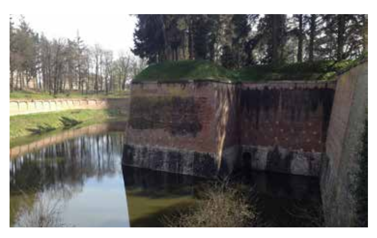
Ramparts surrounding Le Quesnoy

The battle plan resembled that of medieval battles. The Royal Engineers Special Company would fire 300 flaming oil drums onto the ramparts and an artillery barrage would cover the infantry as it advanced to the town. Artillery would then open fire on the ramparts. The advance started early in the morning and there was little opposition as the New Zealand Division moved past the town and into the Forêt de Mormal.